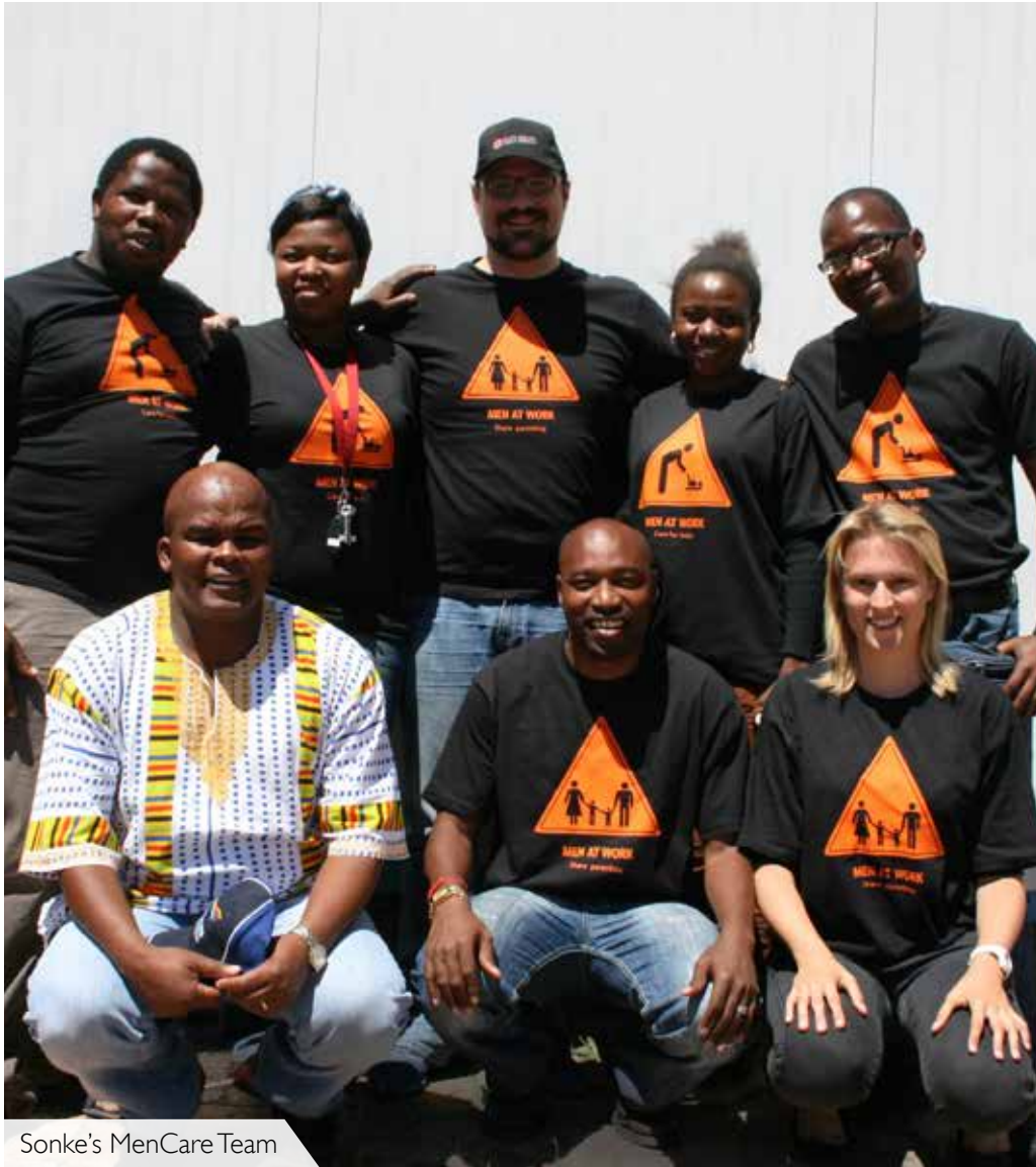
Sonke's MenCare Team

Copyright © 2013: The authors, the Centre for Social Development in Africa, University of Johannesburg, and Sonke Gender Justice. Short extracts from this publication may be produced unaltered without authorisation on condition that the source is indicated. For rights of reproduction or translation, application should be made either to the Centre for Social Development in Africa, University of Johannesburg or Sonke Gender Justice. (Presentation of both organisations) (on the verso of the cover)