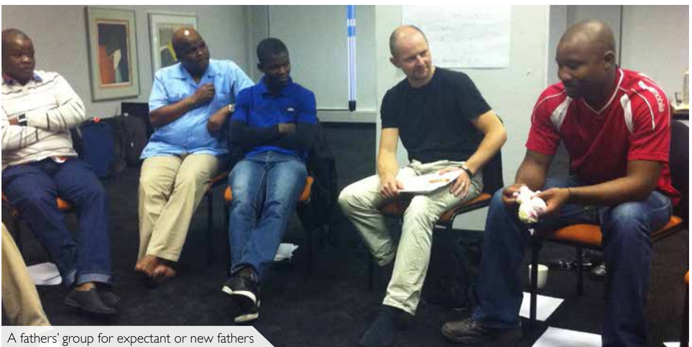
A fathers' group for expectant or new fathers

Given the negative developmental outcomes associated with father absence and the beneficial consequences of a healthy and caring father presence, South Africa's phenomenon of absent fathers constitutes a huge challenge that needs to be tackled. For this reason, it was considered paramount that this problem be fully researched and understood. It was further envisaged that such research would yield important recommendations for policy, programmatic support and educational awareness.